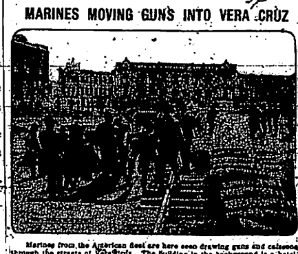
Marines from the American fleet are here seen drawing guns and equipment through the streets of Vera Cruz. The building in the background is a hotel.

Volu WC Anoi For Dakot states matte built. to an const offic tion comp nation publi veyed Air mar Sion, The the re C ON WI N Y A D I T N V L B C