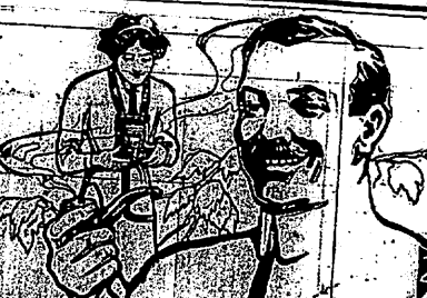
A Picture of Contentment

At the battle of Chitauri, the British soldiers were gathered, and the British soldiers were gathered. The British soldiers were gathered, and the British soldiers were gathered.